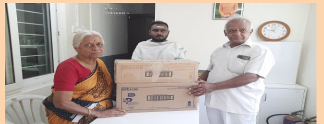
Soaps & Floor Cleaners Distributed at an Old Age Home in Nanmangalam - Nesapakkam