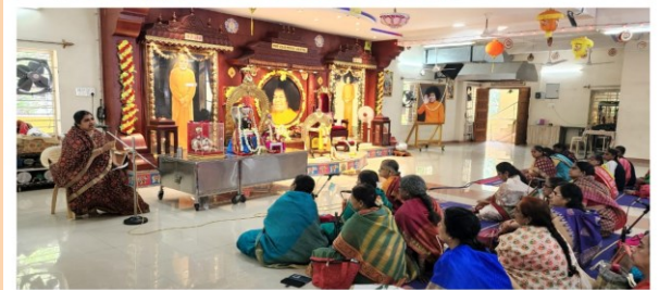
Guru Poornima Celebrations at Sai Pushpanjali on 13 th July'22