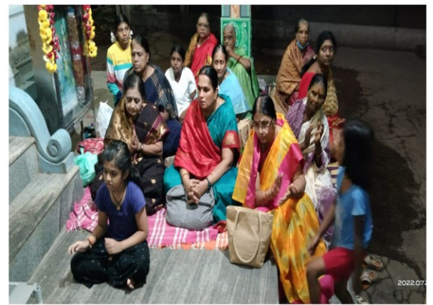
Concluding Session of Rama Katha Rasa Vahini Parayanam - Nungambakkam