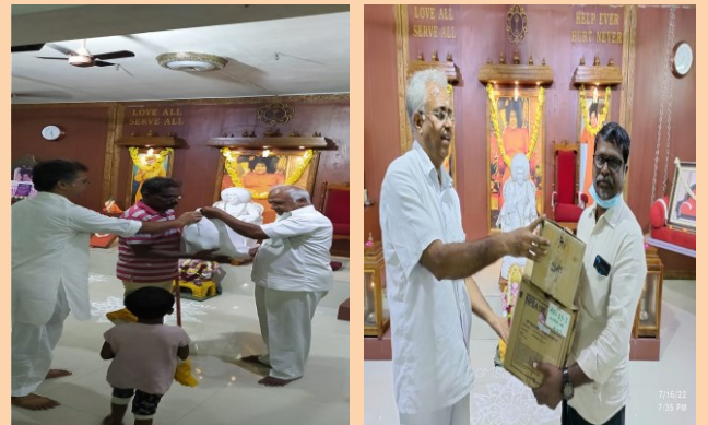
Sanitary Items Distributed at Help & Help Home & at another Home Sathyameva Jayathey - Nesapakkam