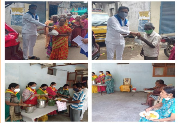
UI Colony Narayana Seva - UI Colony & Kodambakkam

- On the auspicious occasion of Guru Poornima, members of the Rangarajapuram Samithi reached out to help the differently abled students of Deaf & Dumb School at Ramapuram. The students were blessed by Bhagawan to receive 1200 notebooks. The management, staff & students of this institution for the special children were thankful & appreciative of this service.