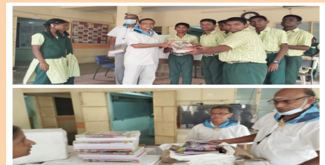
Distribution of Notebooks at Ramapuram Deaf & Dumb School - Rangarajapuram