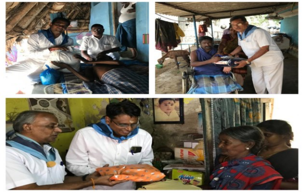
Amrutha Kalasam Distributed to Paraplegic Patients