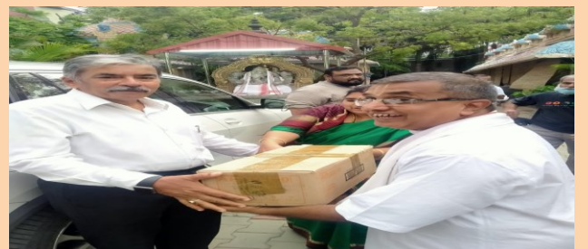
Sanitary Items provided to Poongavanam Residential School at Sirukaveripakkam - T.Nagar