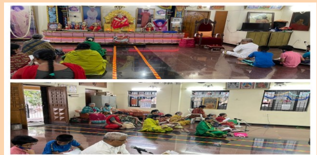
Veda Chanting - KK Nagar