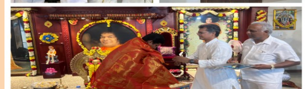
Guru Poornima Celebrations at Sai Pushpanjali on 17 th July'22