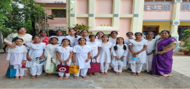
Veda Chanting Balvikas Girls at Sundaram