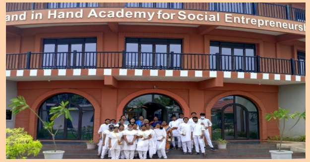
Group IV Children at Kanchipuram

Bathing soap bars (1000 nos.) & floor cleaning liquid bottles (250 nos.) was provided by State Office meant for distribution across the CMW District.