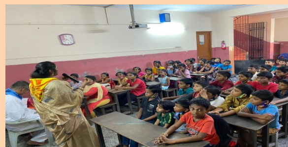
New Balvikas Center at Kodambakkam