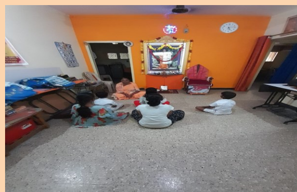
New Balvikas Center - Nungambakkam