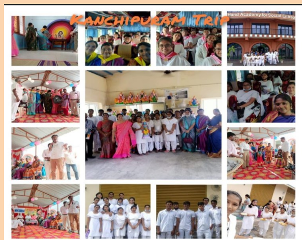
Visit to Orphanage at Kanchipuram by Balvikas Group IV Children