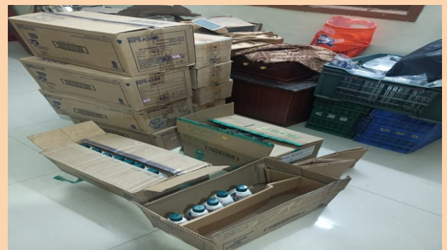
Soaps & Floor Cleaners meant for distribution