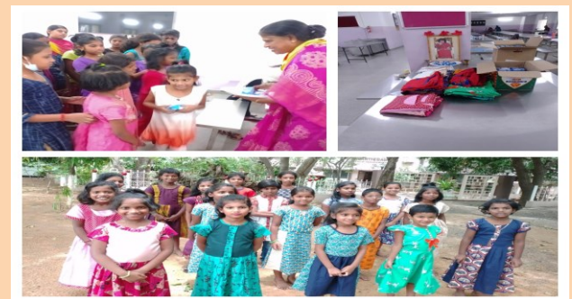
Distribution of Biscuits & Frocks at Madras Seva Sadan - Nungambakkam