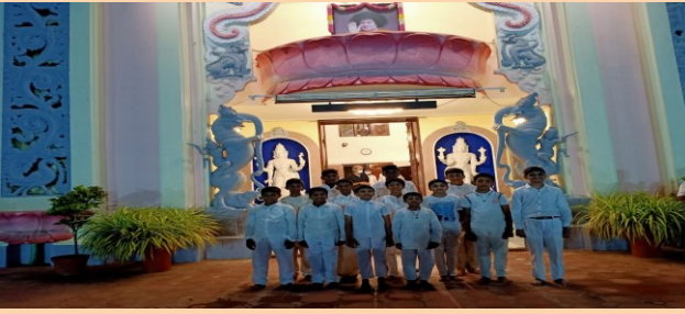
Veda Chanting Balvikas Boys at Sundaram