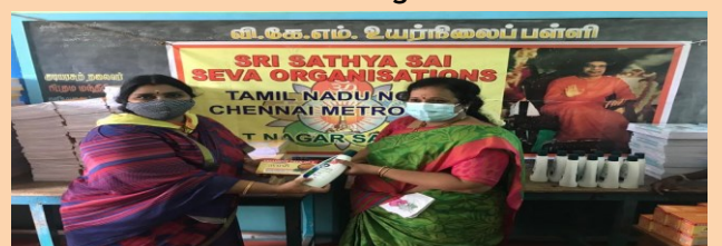
Sanitary Items distributed at VKM High School - T. Nagar