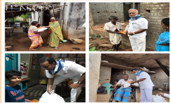
Distribution of Amrutha Kalasam at Acharavakkam Village