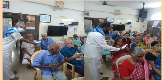
Distribution of Sanitary Items at Akshaya Trust - Valasaravakkam

T. Nagar Samithi also distributed AYUSH Soaps & Floor Cleaners provided by Chennai Metro West to Poongavanam Residential School for Socially backward Children at Sirukaveripakkam (near Kanchipuram) & also to the economically backward children at VKM High School.