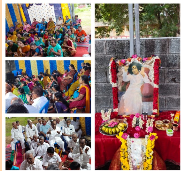
Special Bhajan at Karthikeyan School by Seven Samithis