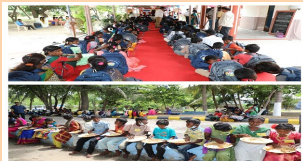
Distribution of School Bags & Stationery at Sirukaveripakkam