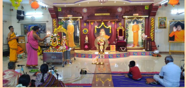
Pradosha Pooja at Sai Pushpanjali