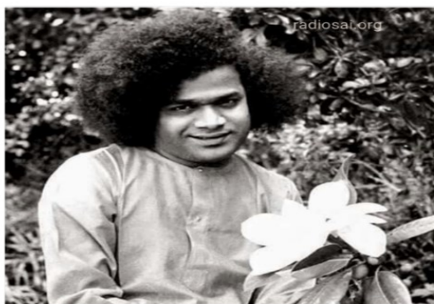
Sri Sathya Sai

Everyone should be prompted by reverence to the Guru, which means not worshipping His photograph, but acting according to His orders, His commands.