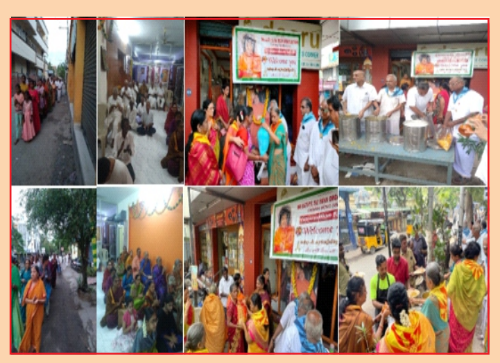
bless\ all\ the\ participants\ and\ beneficiaries.